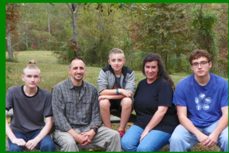
R- Switzer Family Tree Farm