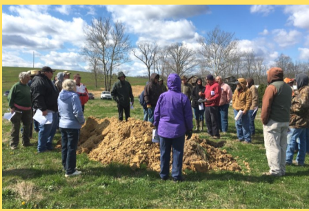
L- Advanced Grazing School

Monthly board meetings of the Athens SWCD Board of Supervisors are held to conduct