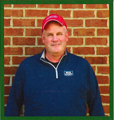
Stanley Farms Conservation Cooperator of the Year

The Athens Soil and Water Conservation District (SWCD) was organized in 1946, the 47 th District in Ohio, for the purpose of planning and carrying out natural resources conservation programs. The District is a political subdivision of the State of Ohio and is governed by a board of five supervisors, elected by the landowners of Athens County, who serve staggered three-year terms. Cooperation with the District is on a voluntary basis and anyone needing assistance in solving natural resource problems may apply for help by contacting our office. Technical aid in planning and applying needed conservation practices will be furnished by District staff and Natural Resources Conservation Service (NRCS) personnel assigned to the District. The District also sponsors various educational programs and is available to assist students and educators with projects. All services provided by the District are at no charge to the public. Funding for the District’s work is provided by the Athens County Commissioners, the City of Athens, the Athens County Auditor and ODNR Division of Wildlife. Additional financial assistance is provided by the State of Ohio through the Ohio Department Agriculture, Division of Soil and Water Conservation. Monthly board meetings of the Athens SWCD Board of Supervisors are held to conduct business. All meetings are open to the public. Contact the office for date and time of meetings.