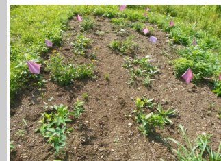
The Plains Preserve Pollinator Way Station on Johnson Road