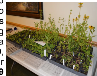
Milkweed and Nectar Rich Plants were distributed to landowners through out Athens County.

Thank you Scott's Miracle Gro and Ohio Prairie Nursery for your generous donations!