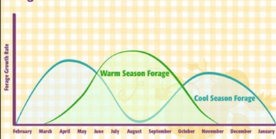
Forage Growth Patterns

This FREE workshop is limited to 30 participants so we are asking for pre-registration by calling the Athens SWCD at 740-797-9686 ext. 6290.